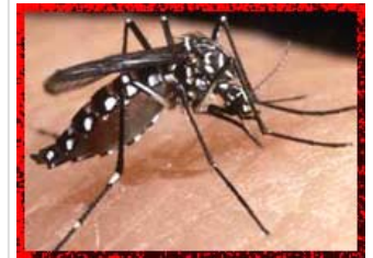
Aedes Mosquito. The cause of dengue among young children.

Persons with dengue should rest & drink plenty of fluids. They should be kept away from mosquitoes for the protection of others. It is also treated by replacing lost fluids. Some patients need transfusions to control bleeding.